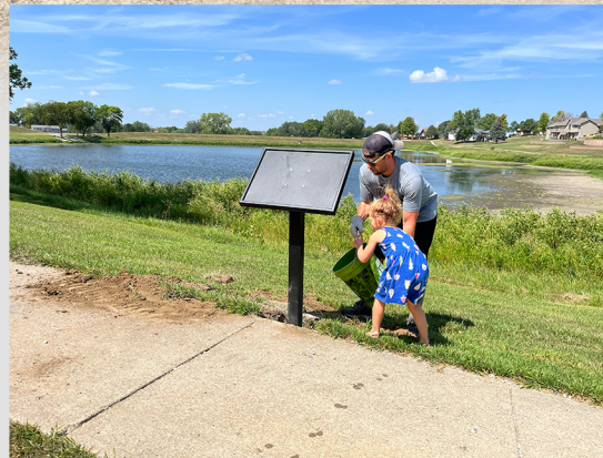
The Dunlap StoryWalk was installed by volunteers in August of 2023.